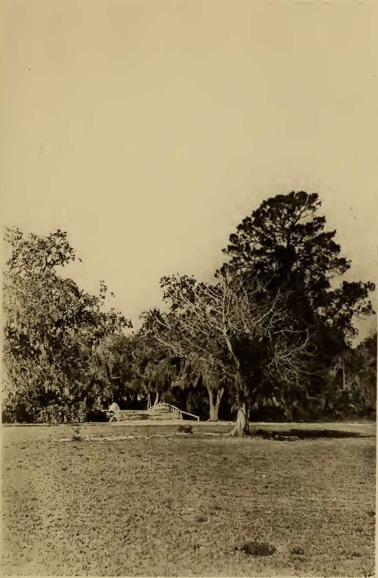
VIEW FROM OLD GOLF FIELD.